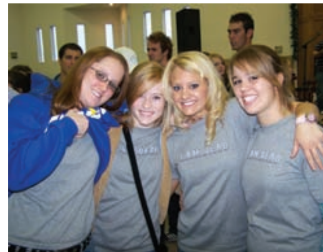
Katalyst Weekend at Padre Island Baptist Church

My path landed me at a private Christian college. I was quickly introduced to what has affectionately been termed the "Christian bubble". If you are not familiar with this term I will choose my words respectfully as to not offend any of you who may find yourself in one of these said "bubbles" in light of a brief description. Within my bubble everyone looked, acted, and thought the same way. If you didn't like your bubble you could maybe think a little different or maybe listen to different music, but all you ended up doing was transferring your membership to another bubble. Just a bunch of bubbles bouncing around bumping off of each other. My bubble was popped on December 12, 1999. To spare the long, exhaustive details I will summarize by saying a simple conversation with a very respected friend turned into my realization that I had been faking way too much of my "Christian walk". For the next year and a half I borrowed a line from U2 that screamed out, "I want tear down the walls that hold me inside".